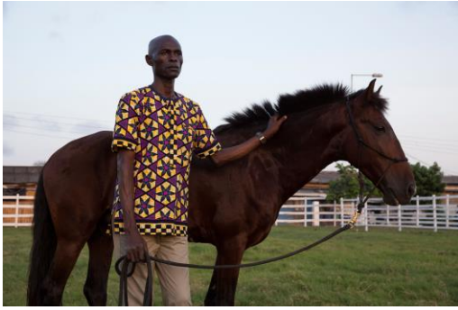
AKI provides funds to The Six Freedoms-Ghana to rescue and care for abandoned and mistreated horses.